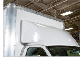
Wind fairing on 85" high model