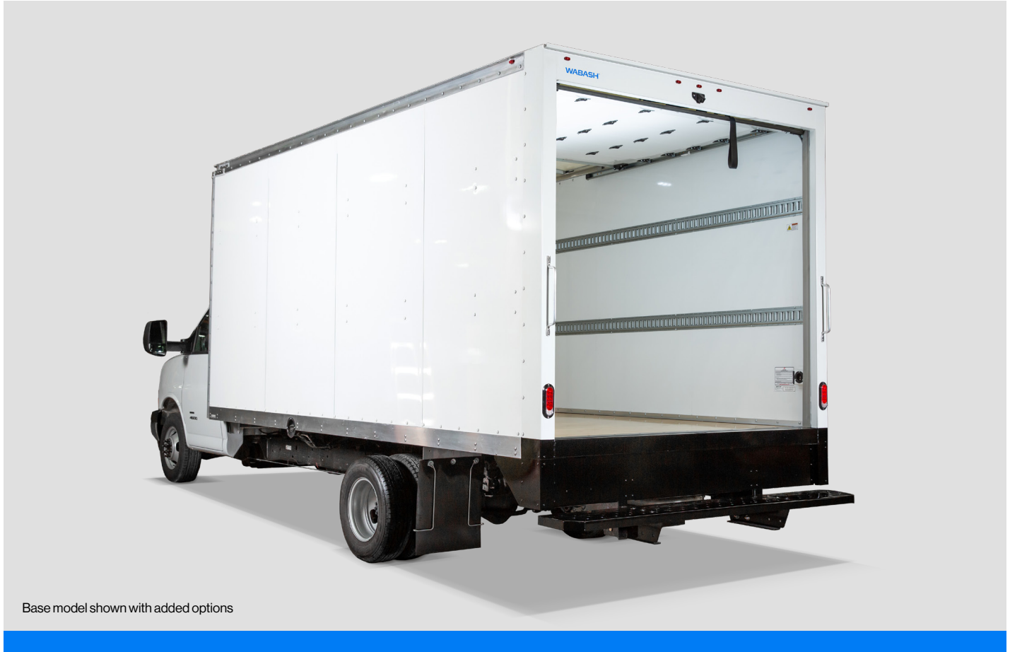
Base model shown with added options