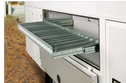
Horizontal Roll Out Shelf