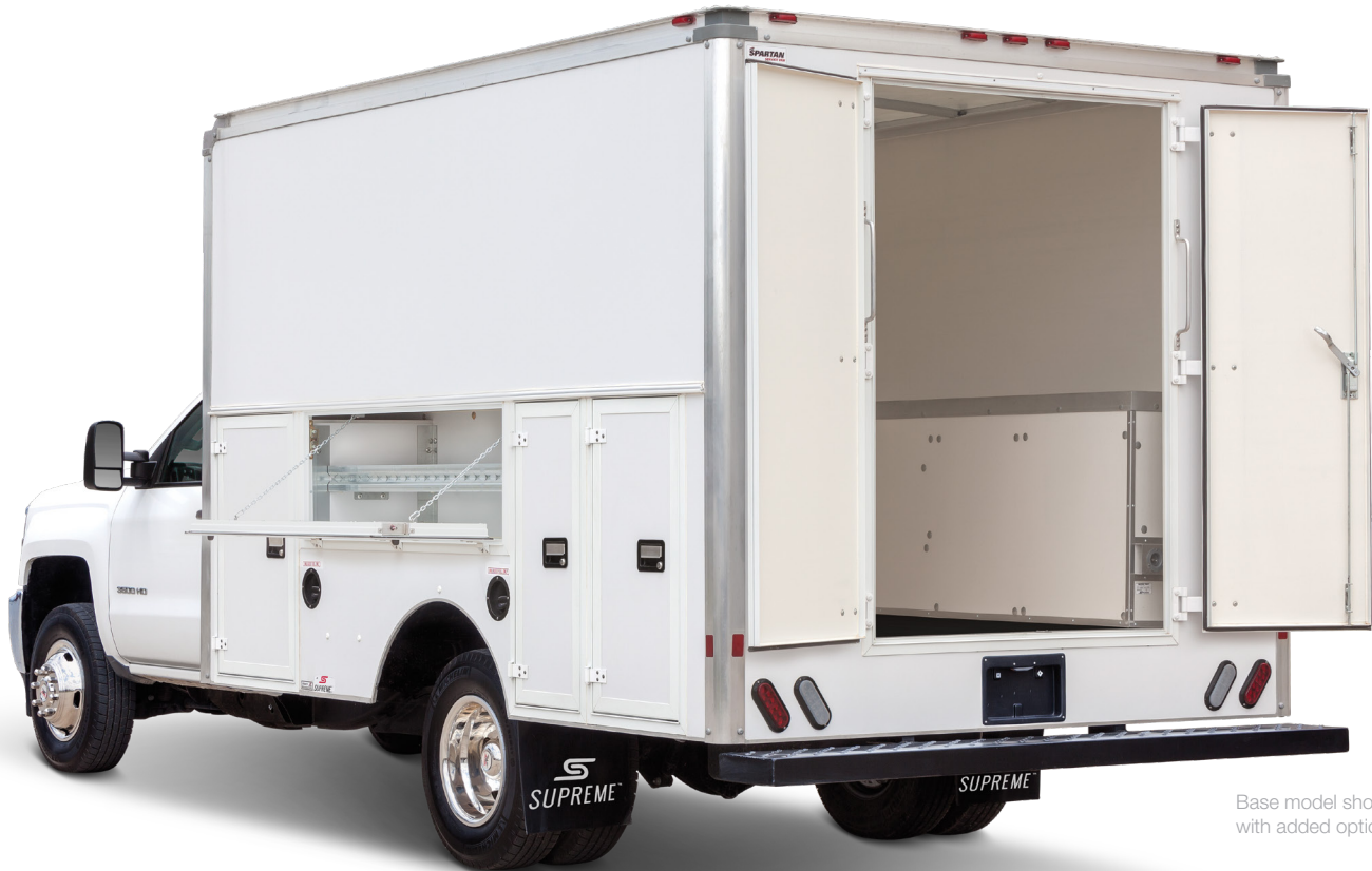
Base model shown with added options